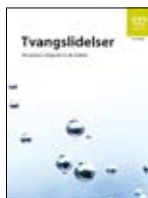
Obsessive Compulsive Disorders IS-1469