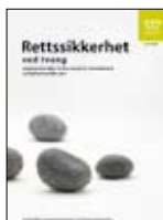
Legal protection IS-1467