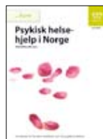
Mental health care in Norway • For adults, IS-1472 • For young people, IS-1474 • About young children, IS-1473