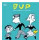
BUP • Children, IS-1301 • Young people, IS-1302 • Adults, IS-1303

Brochures can be downloaded at www.psyiskisk.no under Information Material.