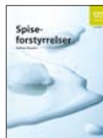
Eating disorders IS-1470